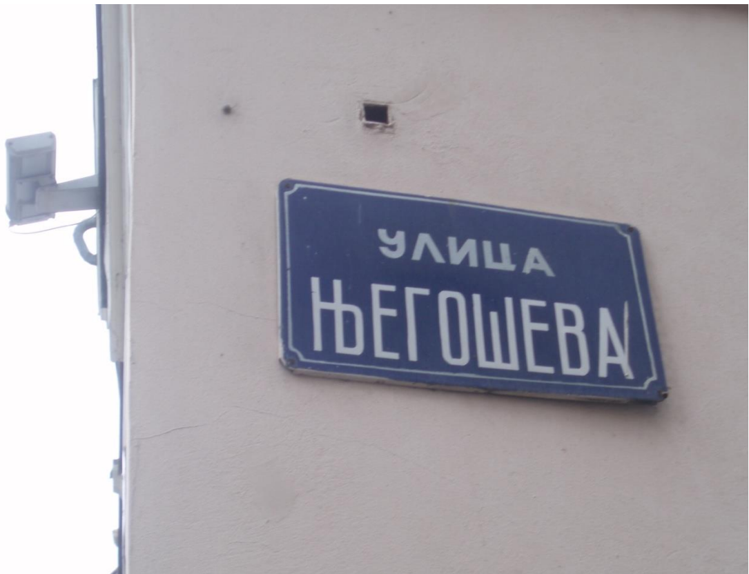
4. The presence of Njegoš in Serbian public space: Ulica Njegoševa [Njegoš Street] in the centre of Novi Sad (Hun.: Újvidék), 2016.

The Yugoslav War put an end to the Gorski vijenac as the poem of South Slavdom, confining it to Serbian literature. But controversies were not over yet, as the proclamation of independence of Montenegro in 2006 led to a new contention over Njegoš's heritage, with the Montenegrins claiming him as the father of the Montenegrin nations on the one hand, and the Serbs regarding him and the Gorski vijenac as the quintessential embodiment of Serbianness on the other.