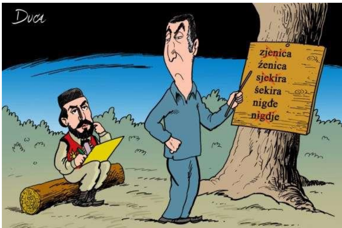
1. Montenegrin Prime Minister Milo Đukanović teaches Njegoš the new Montenegrin language. Art by Dušan “Duca” Gadjanski, published on http://www.in4s.net/sta-bi-rekao-njegossrbiu-crnoj-gori-u-zoni-aparthejda/ (accessed on 2 nd August 2016).

some broader, pan-Slavic topics, I reserve the right to use either “former Serbo-Croatian” 58 or even the old-fashioned but still useful “Serbo-Croatian”: The only alternative would be to opt for some über-politically correct expressions like Local Language or BCMS (an acronym standing for Bosnian-Croatian-Montenegrin-Serbian) which I personally regard as sad, bureaucratic labels which only humiliate a language which boasts centuries-old literary traditions as well as its speakers.