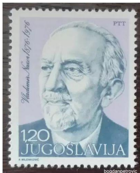
3. The 1976 Yugoslav stamp marking the centennial of the birth of Vladimir Nazor. http://www.ebay.com/itm/1976-YUGOSLAVIA-COMPLETE-SET-MNH-vladimir-nazor-famous-people-serbia-J11/351800092362 (accessed on 12 th August 2016).

collection of epic poems first published in 1912 under the name of Knjiga o hrvatskim kraljevima [The Book of Croatian Kings]. The poems in Hrvatski kraljevi recount the history of the Croats through the deeds of their banovi [governors] and kings, from the arrival of the Slavs in the Balkans down to Petar Svačić (?-1093), the last Croat to rule the country before the crown was taken by the King of Hungary Coloman (circa 1074-1116).