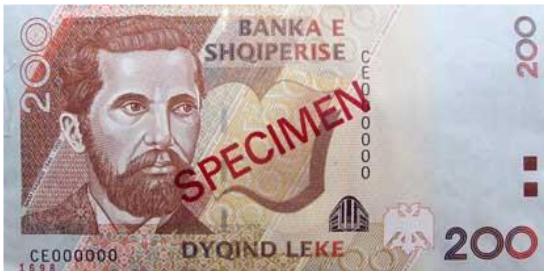
6. Portrait of Naim Frashëri on the two hundred Albanian Lek bill. https://www.bankofalbania.org/web/200_leke_5653_1.php (accessed on 8 th August 2016).

Naim's figure, together with his two brothers, soon became a firm part of the Albanian national pantheon, a position left untouched by the succession of regimes Albania has experienced in the twentieth century. 70