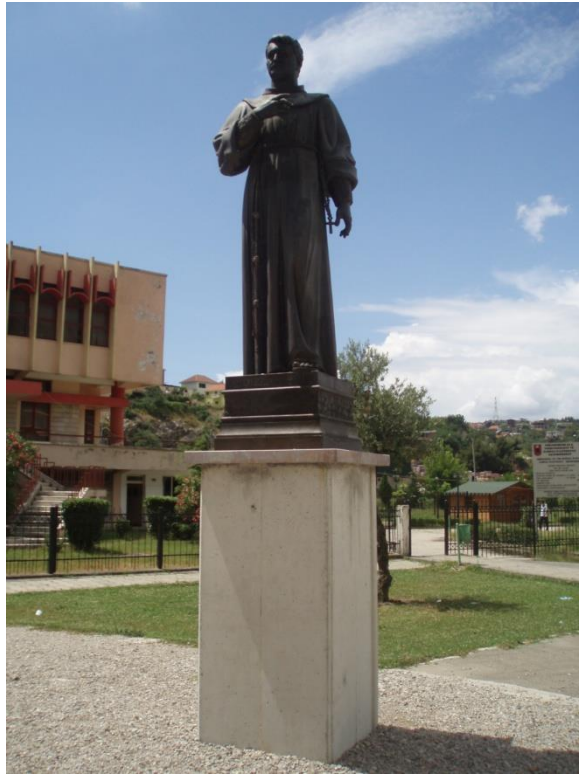
7. Statue of Fishta in the centre of Lezha: A sign of his rehabilitation in post-communist Albania, 2010.