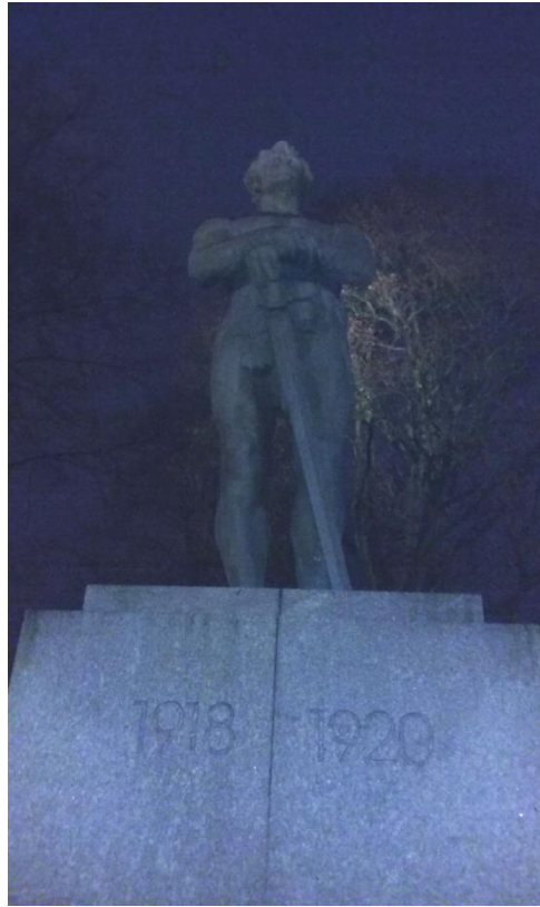
9. The Kalevipoeg statue in Tartu, 2015.