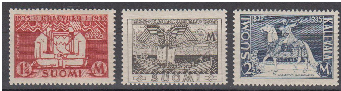
8. The 1935 stamp series celebrating the centenary of the publication of the Kalevala . http://www.ebay.com/itm/Kalevala-100-Centenaryof-the-national-Epic-

language and having inspired countless artistic production, 8 to the point that the date of its publication is the date of national holiday of that country (28 th February). In the twentieth century, the epic and its composition history, i.e. the collection of Finnish folklore in Karelia 9 by Lönnrot, were the bone of contention between Finnish and Soviet scholars, for the latter intended to frame Karelian culture as integral part of Soviet heritage, and by extension not so subtly advocating a Soviet ascendancy on the founding literary monument of Finnish culture: Given Finland's precarious situation vis-à-vis Soviet Union during the Cold War, it is not hard to realise why the struggle over the Kalevala became such an important issue in the cultural and political life of Finland. 10